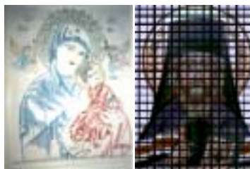
Fabric Icons / SI0510 Actual projects not depicted