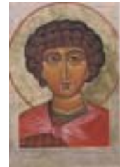
Egg tempera / SI0502