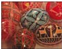
Pysanki Eggs / SI0508