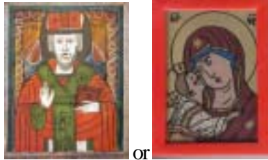
or Glass icon / SI0505