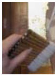
Gilding Techniques / SI0501