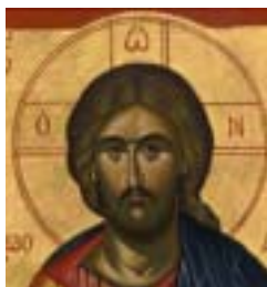
Wax Encaustic / SI0507