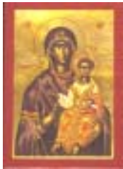
Egg tempera / SI0506